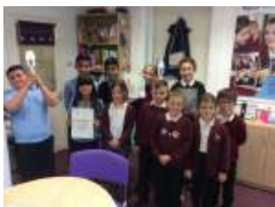
Children wearing examples of acceptable uniform