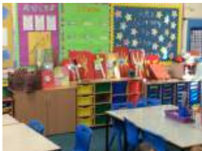
Examples of work from across school

In P.E. children have lessons in gymnastics, dance, and games throughout Key Stage One and Two. We also have a full programme of swimming lessons. Children in Year 5 receive coaching in table tennis and there are a range of opportunities in competitive sports such as cross-country running, football, trampoline and cricket. Some of our PPA cover is taught alongside PEAK specialist PE teachers who bring expertise in Sport. We also offer Computing and Forest Schools experts to enhance our exciting curriculum.